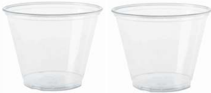
2 clear plastic cups