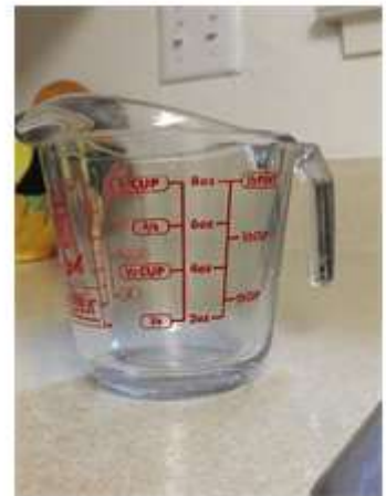
3/4 cup of water